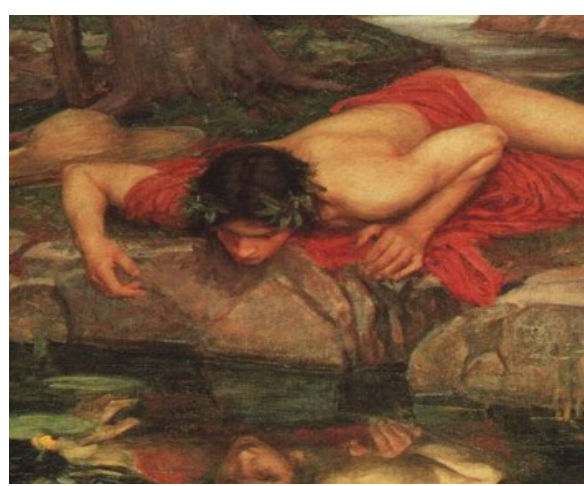
Detail from J. W. Waterhouse's Echo and Narcissus (1903)

Another young man, spurned by Narcissus, cried out that Narcissus should be cursed to fall in love but never be able to have what he wanted. The goddess Nemesis heard this young man's wish and led Narcissus to a mirror-like spring. When Narcissus saw his own image, he instantly fell deeply in love. He tried to speak to, kiss, and embrace the beautiful boy but found the two of them always separated by a thin layer of water. When he touched the water, it disturbed the reflection, and he could no longer see the boy. Therefore, Narcissus sat just staring at his image, refusing food or water, until he finally died. Echo, still mindful of her love, repeated Narcissus's last "Goodbye" to the boy in the spring. The gods then turned him into a beautiful flower. (This version of the story comes from Ovid's Metamorphoses, Book 3)