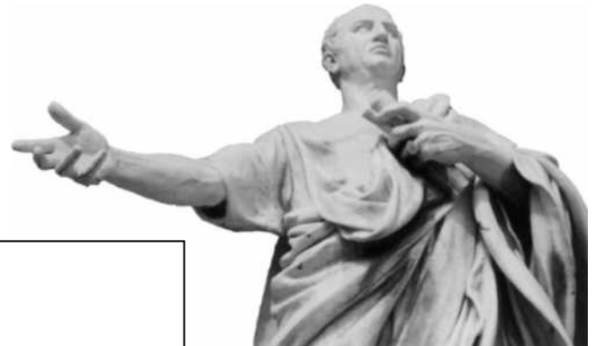
statue of Quintilian