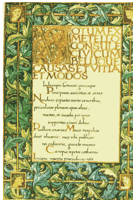
Manuscript pages from collections of Horace's Poetry